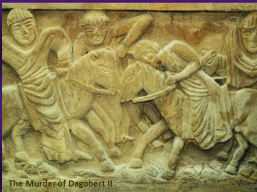
The Murder of Dagobert II

In addition, as direct descendants of the historical Christ himself, they would have possessed access to the secret teachings of Christ, no doubt shockingly different from the ones promoted by the Church, and reflecting more of the "secret doctrine" of the rebellious gods. Any public knowledge of this or the blood relationship between Christ and the Merovingians would have been disastrous for the Church. Christ would therefore be a man, with antecedents and descendants, instead of the "son of God, born of a virgin" concept promoted by the Church. Seeing in Dagobert a potential threat, the Roman church entered into a conspiracy with Palace Mayor Pepin the Fat.