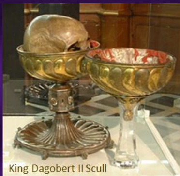
King Dagobert II Skull

“The reason for Dagobert’s canonization remains unclear. According to one source it was because his relics were believed to have preserved the vicinity of Stenay against Viking raids - though this explanation begs the question, for it is not clear why the relics should have possessed such powers in the first place. Ecclesiastical authorities seem embarrassingly ignorant on the matter. They admit that Dagobert, for some reason, became the object of a fully-fledged cult... But they seem utterly at a loss as to why he should have been so exalted.” The Church certainly tried to move away from its role in the king’s