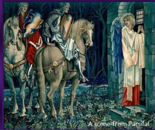
A scene from Parsifal

Since the time of King Clovis I, the Merovingian kings had been under a pact with the Vatican, in which they had pledged their allegiance to the Mother Church in exchange for Papal backing of the united empire of Austrasia. They would forever hold the title of "New Constantine", a title that would later morph into "Holy Roman Emperor". But that "allegiance" on the part of the Merovingians towards the Church began to wear thin after a while. Given their infernal and divine origin, their spiritual bent was slightly different from that of organized Christianity.