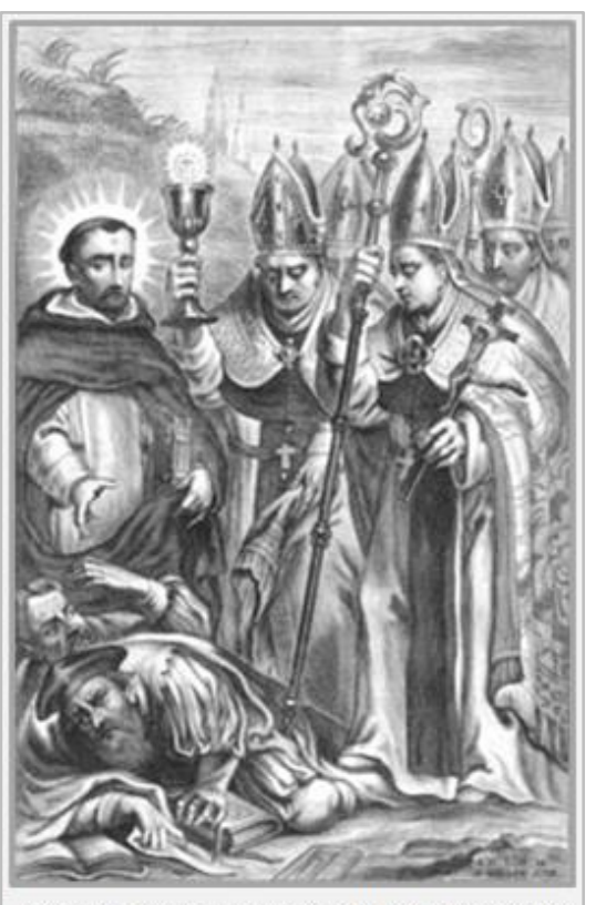
Arnaud, other Cistercian abbots and Saint Dominic (with a halo) crush helpless Cathars underfoot - a sanitised version of the persecution of the Cathars.

As the Song of the Cathar Wars relates, the people of the Languedoc laughed at him and scorned him as a fool [laisse 3].